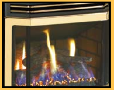
Shown with optional gold door crown and gold rod grille

The TrueGlow Burner, an exclusive from Quadra-Fire, sets a new standard for realism. The ceramic burner is molded from real wood pieces and coals. Flames rise from gas ports distributed throughout the glowing coal bed and lower logs, producing an incredibly active and varied fire. No need to hide the burner anymore—the TrueGlow burner proudly takes center stage, with an appearance that